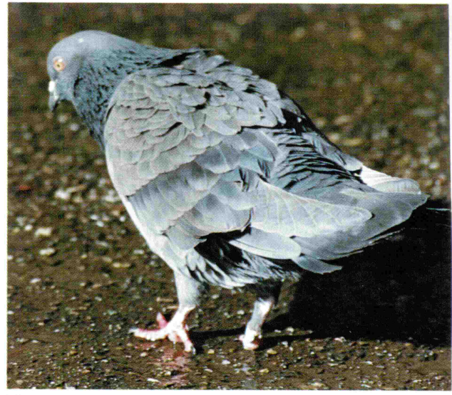
This feral has had the bad experience of being maimed. Birds like this are often left crippled in attempts to escape pigeon traps.