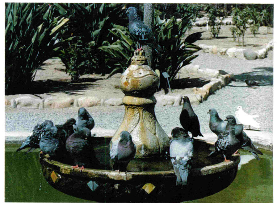
San Juan Capistrano has become a sanctuary for many feral pigeons.