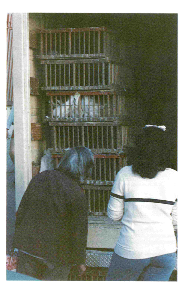
In San Francisco's Chinatown, white pigeons await purchase and a stew pot.