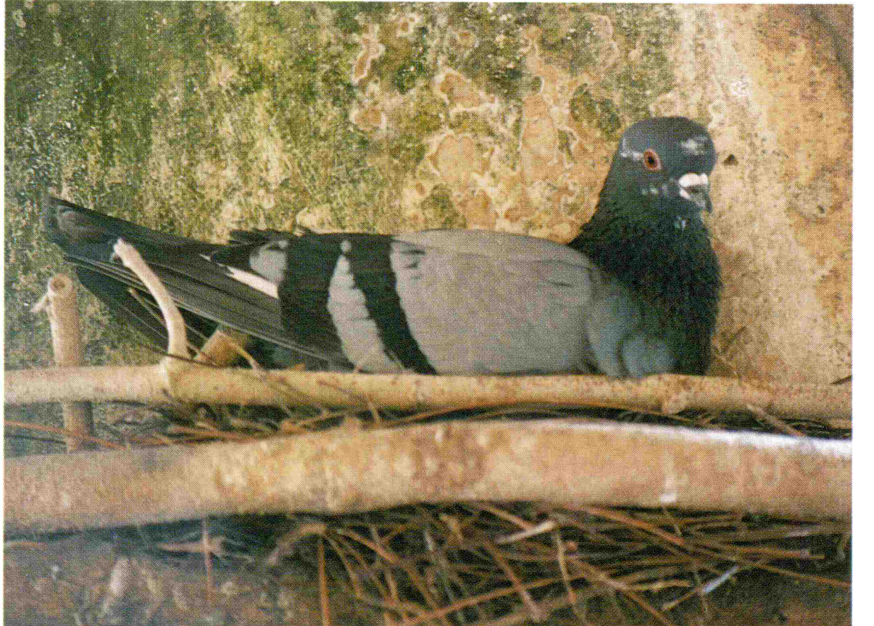
This feral hen nests on the ledge of an old church building.