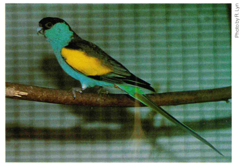
Male hooded parakeet (Psephotus chrysopterygius dissimilus).