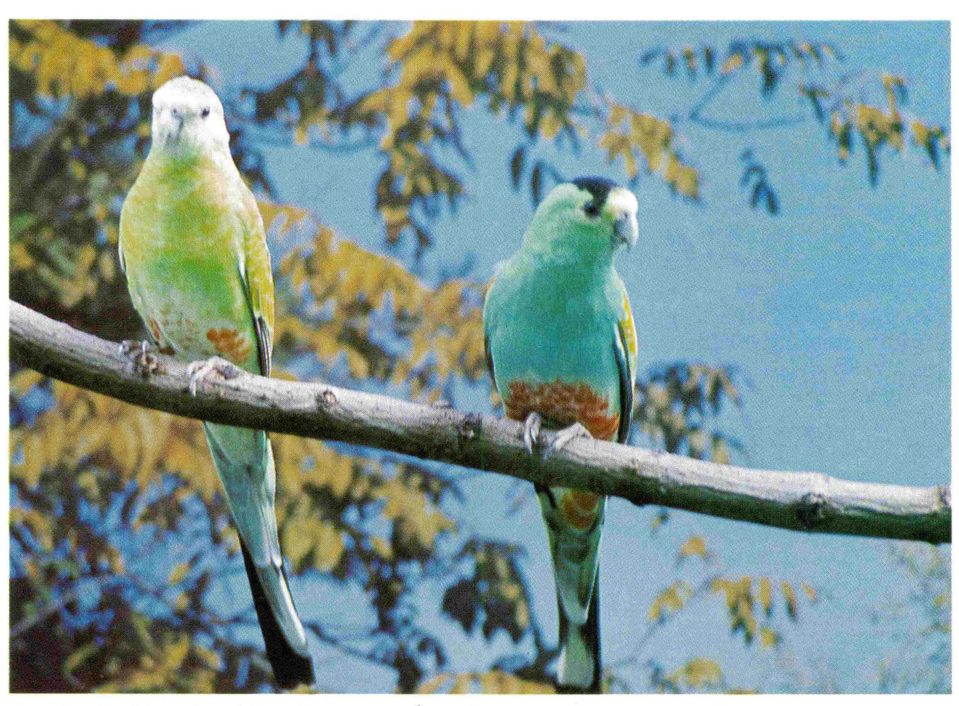
A pair of golden-shouldered parakeets (Psephotus c. chrysopterygius). This is the nominate species of which the hooded parakeet is a sub-species. The golden-shouldered is seldom if ever found in aviculture.

The adult male is turquoise blue over most of the body, rump, and cheeks. The feathers are highly irridescent, giving the male a jewel-like appearance. The wing patches are bright yellow. The head has a black "hood" which extends down the nape and blends into the back which is greenish-black. The tail and flight feathers are also greenish-black, central tail feathers are tipped in white. The vent feathers are crimson. The