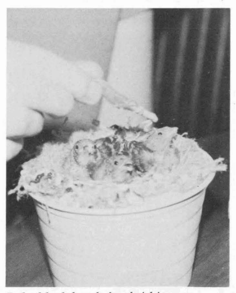
Baby black-booded red siskins.

Pat: Every two hours, the crop will be empty at that time. They beg very