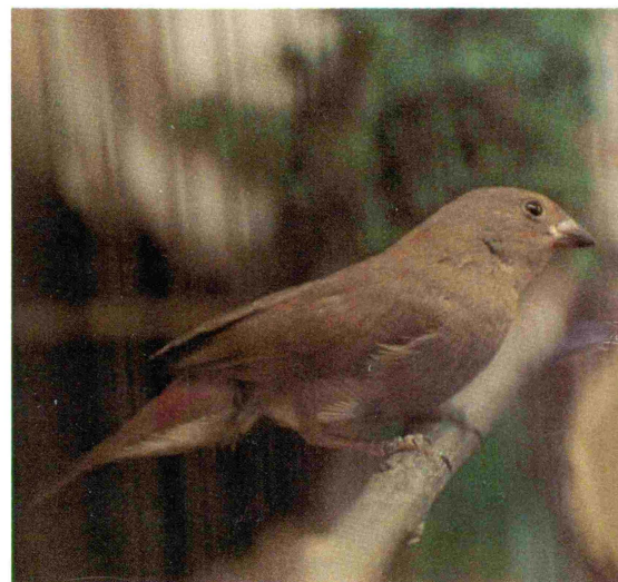
Recently fledged fire finch — fire finches can definitely be fostered, although placing nestlings under a pair of breeding societies is not the best way.