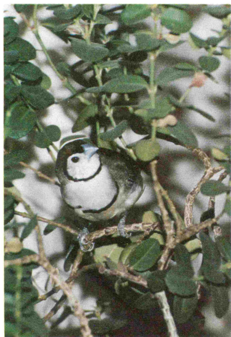
Owl finch — owl finches are commonly fostered under society finches. However, when properly managed, owl finches make excellent foster parents themselves — even for waxbills.

had been surrounded by other breeding birds of the same or similar species, and both pairs had displayed an interest in breeding although they were unable to produce young themselves. Both pairs had strong pair bonds and had shown indications of being capable parents. Housed separately, each foster pair was undisturbed by other birds.