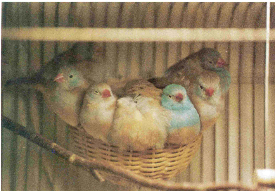
Basket of young blue-caps with their parents — blue-caps may be easily fostered under red-cheeked cordons because of their close relationship. Breeding both species simultaneously could provide a "safety" for abandoned young, especially when the clutch is large and the demand for live food is very high.

reasons these two unusual fosterings worked.