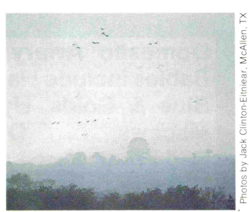
A flock of military macaws as they travel from their roosting to feeding areas in the morning fog.

a cloudless blue sky and a tree full of vibrant green and red macaws!