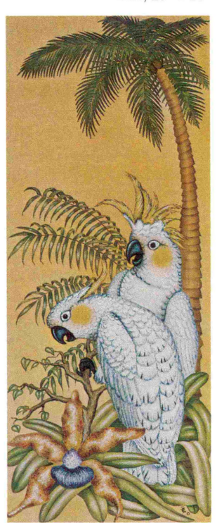
size, 10" x 24" THE COCKATOOS

OR ORDER BY PHONE (619) 279-2326 or (619) 278-0658