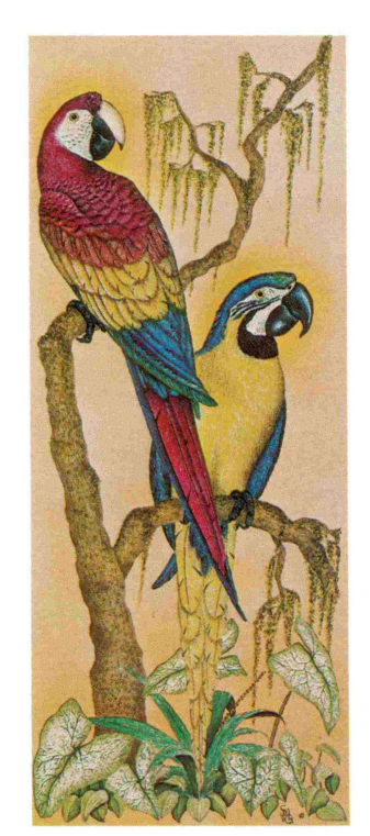
size, 10" x 24"