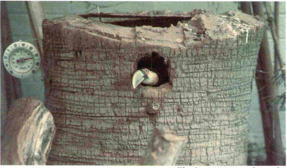
The thermometer near the nest log.

We publish a monthly bulletin on all aspects of aviculture. Anyone interested in becoming a member please contact; Don & Connie Howard, 1005 N. Eucalyptus, Rialto, CA 92376. Yearly dues $15.00. Overseas members, please add $5.00 to cover postage.