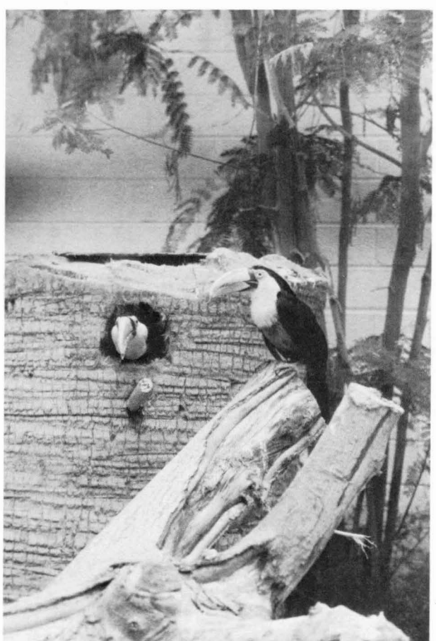
Preparing the nest log.

hatched and required frequent feedings. The male would relieve the female for short times in the mornings and evenings for eating and bathing. Even so, within a week of hatching, the female was increasingly reluctant to continue the frequent feeding schedule. Although the male would feed and nest, he was not prepared to do so alone, apparently, as he would attack the female whenever she would try to stay out of the nest for a time of more than 15 minutes. We were anxious at this time as to whether or not the parents would care for the babies during this critical period and were constantly looking for any babies which might be tossed out of the nest.