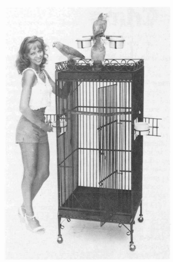
"THE AMAZON DELIGHT" 24" x 24" HEIGHT-52" or 58"