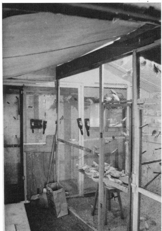
Indoor aviary for holding canaries.