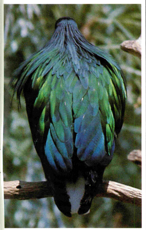
Nicobar Pigeon (Caloenas nicobarica). This rear view shows the long shining hackle feathers that hang over the mantle and shoulders.