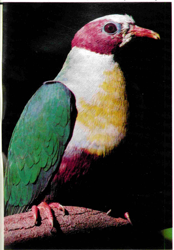
Yellow-breasted Fruit Dove (Ptilinopus occipitalis)