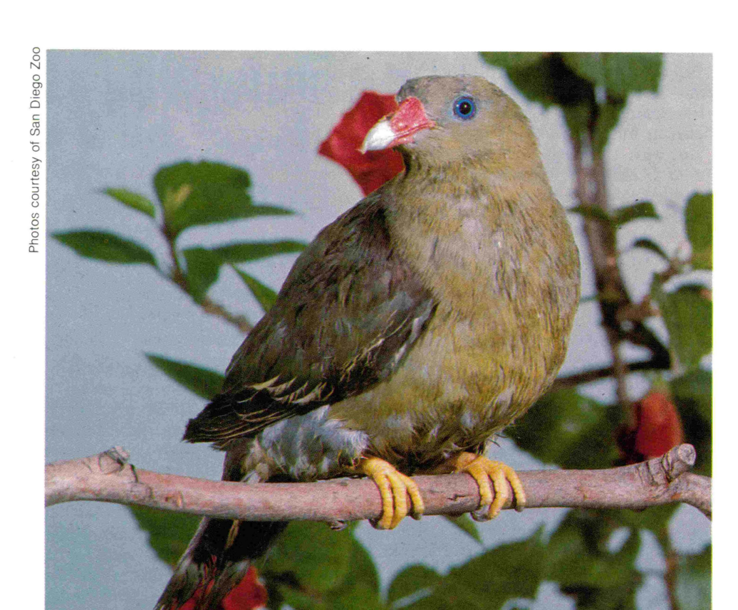
Thick-billed Green Fruit Pigeon (Treron curvirosta)