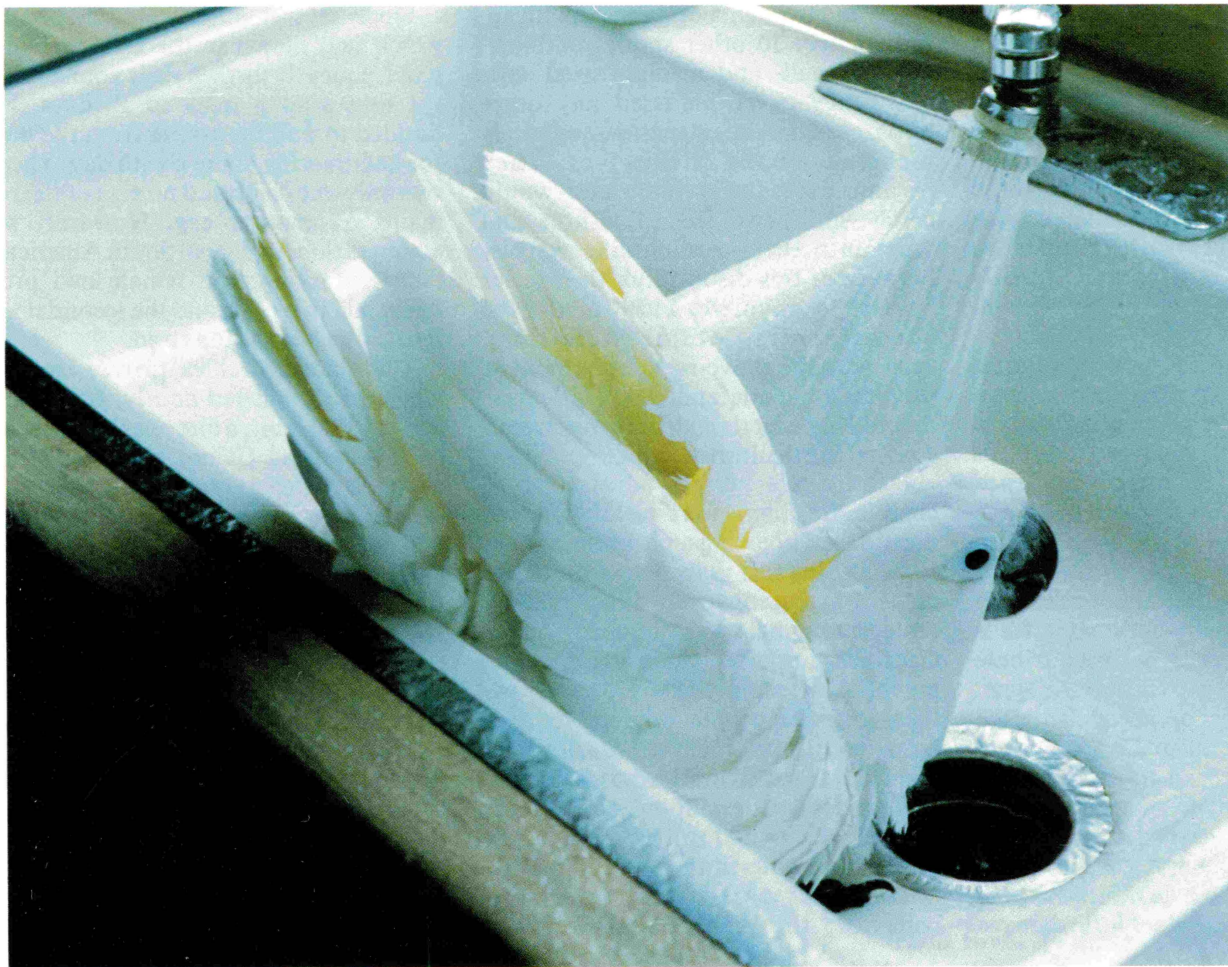
2nd place, pet bird category, Jackie Marciacq, Vallejo, CA -Greater sulphur crested cockatoo - "Cool play."