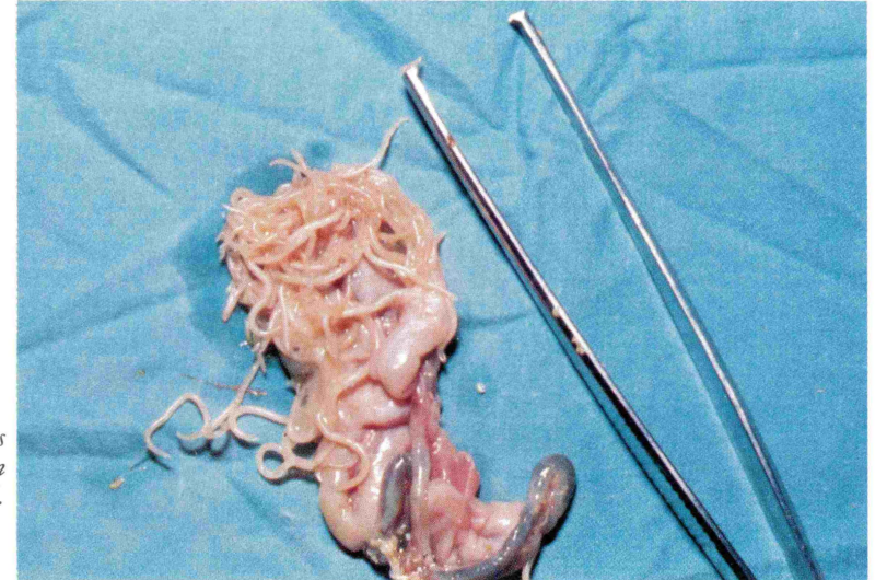
Roundworms recovered from a cockatiel.