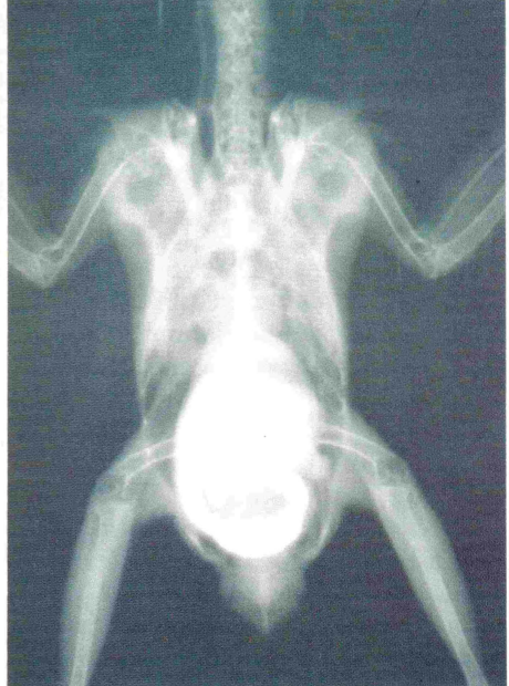
Barium x-ray study of mynah diagnosis: tumor of pancreas.