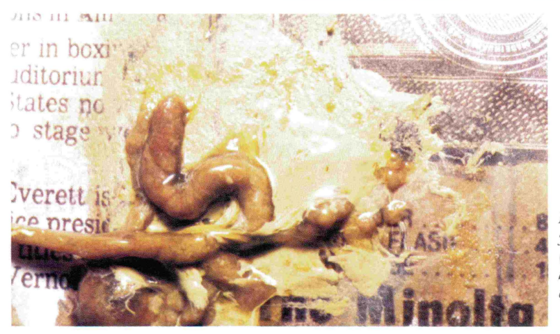
Dropping with yellow urates (suggestive of liver or blood cell disease.)