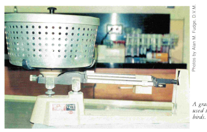
A gram scale used to weigh

Unfortunately, some disease processes are irreversible or not recognized in due time, resulting in the loss of birds. Sometimes sudden death is the only feature noticed. The most exacting information can be obtained from a properly performed post mortem exam. Tissues are submitted to laboratory for microbiological cultures and microscope examination by a pathologist. Birds requiring a post mortem should be promptly refrigerated (not frozen) and submitted to an appropriate veterinarian •