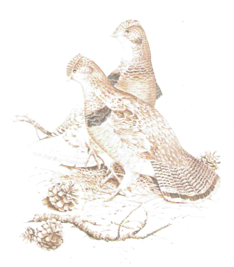
Ruffed Grouse, Grey Form

develop a commercial audience. Meeting with almost immediate acceptance, he soon was doing a brisk business.