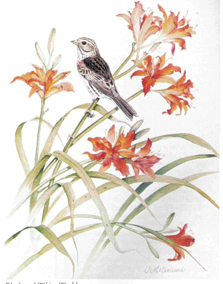
Black and White Warbler