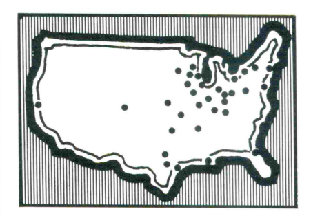
Kaytee feeds are distributed nationwide

It is Kaytee quality that has made its product known nationally. In business since 1866, the company continually improves its product and services. All Kaytee products should be available at a dealer near you. If you have no dealer, please contact Kaytee Products, Inc., Chilton, Wisconsin 53014.