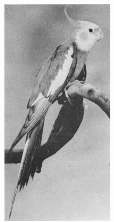
Normal Male Cockatiel

recent mutation developed by selective breeding. The Lutino Cockatiel, also sometimes referred to as the White or Albino, Cockatiel, first appeared in North America in 1958 in private aviaries. This attractive color variant is fast becoming the most popular pet of the parrot family, except for the budgerigar or grass parakeet.