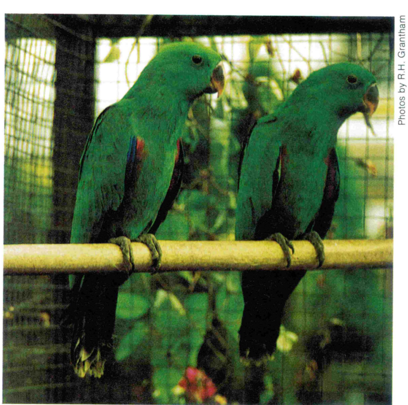
Two immature males.