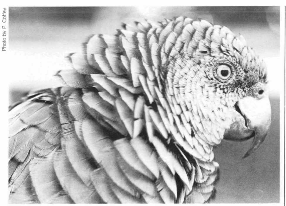
A St. Lucia Amazon (A. versicolor). If confiscated in an illegal shipment of birds, this endangered species would be destined for a "permanent quarantine."