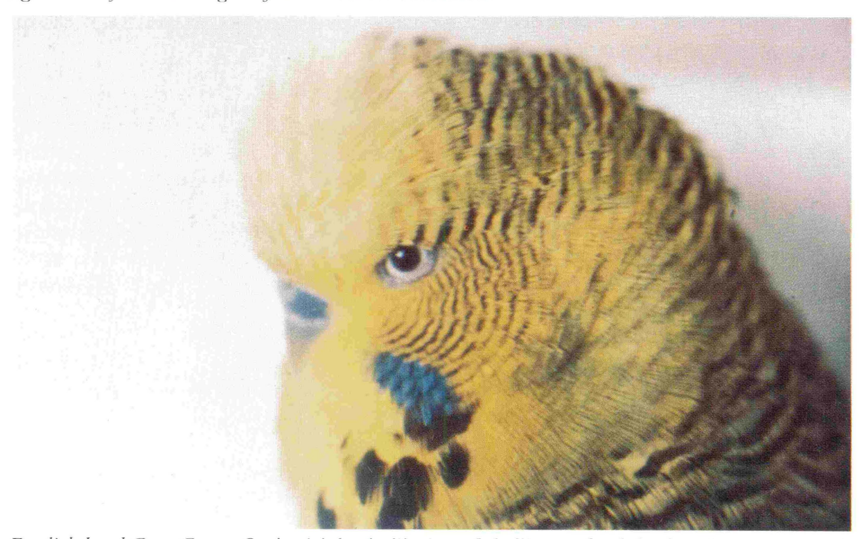
English bred Grey Green Cock with both dilution of shelling and subtle sheening most prominent in cheeks, lateral nape (this is a common site), with complete loss of shelling in patches behind the eye. Age 3 years, carries opaline factor.

As this is a definitive article, its purpose is not to attribute cause and effect, but to delineate properties of the disorder or disorders so that observations and studies can be made as to the etiology before dilution of shelling and sheening become a fact of life in all specimens and thus no remedy available.