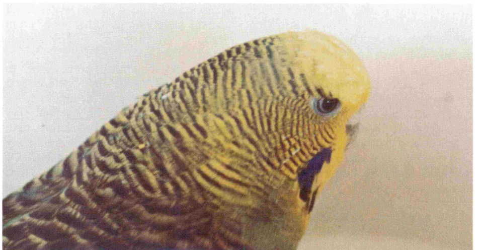
American bred hen, minor flaw of dilution of shelling on crown lateral nape, and cheek over to right side of mantle. Age 2 years—mother cinnamon.