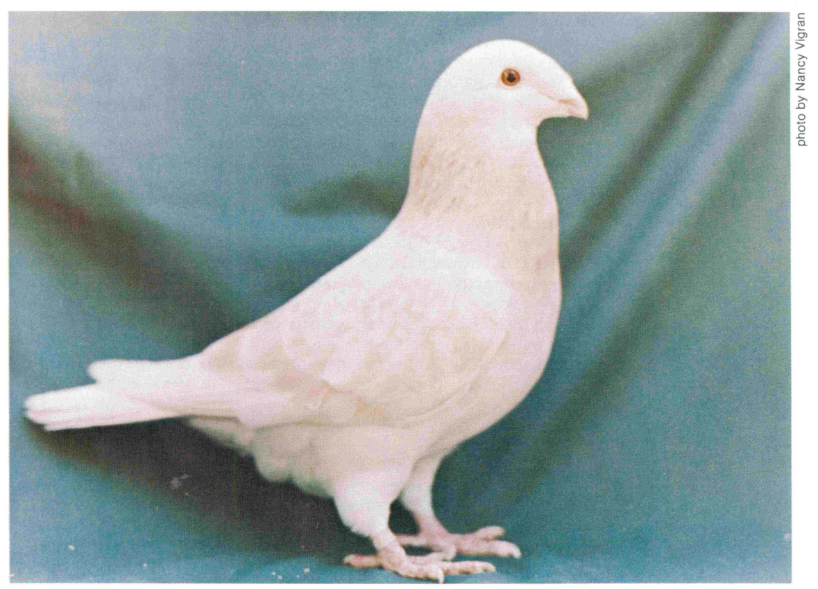
Yellow Show Racer, breeder/owner, Bill Rice