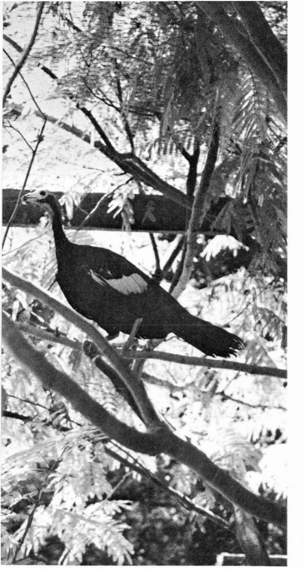
Top – White-headed Piping Guan Bottom – Bronzy Guan on nest