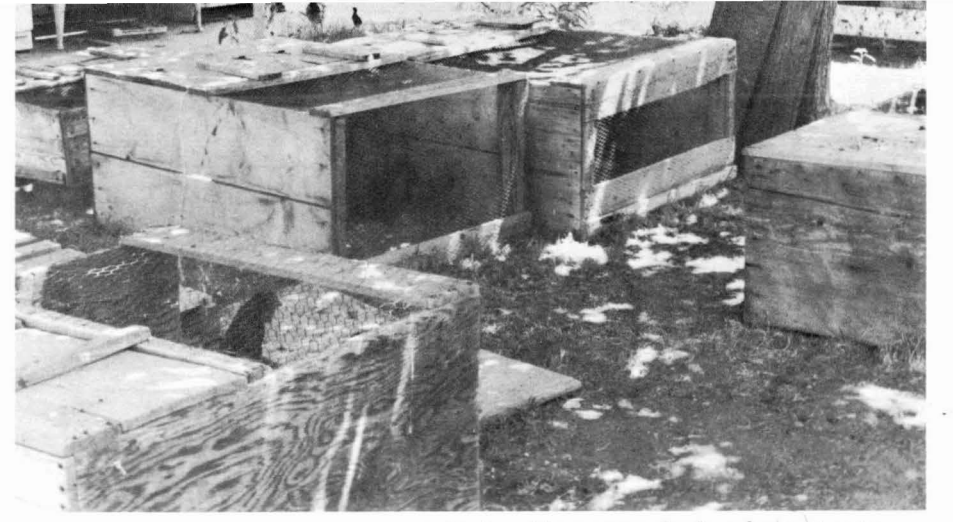
Brooder boxes containing hen chickens for brooking young ducks, pheasants, etc.