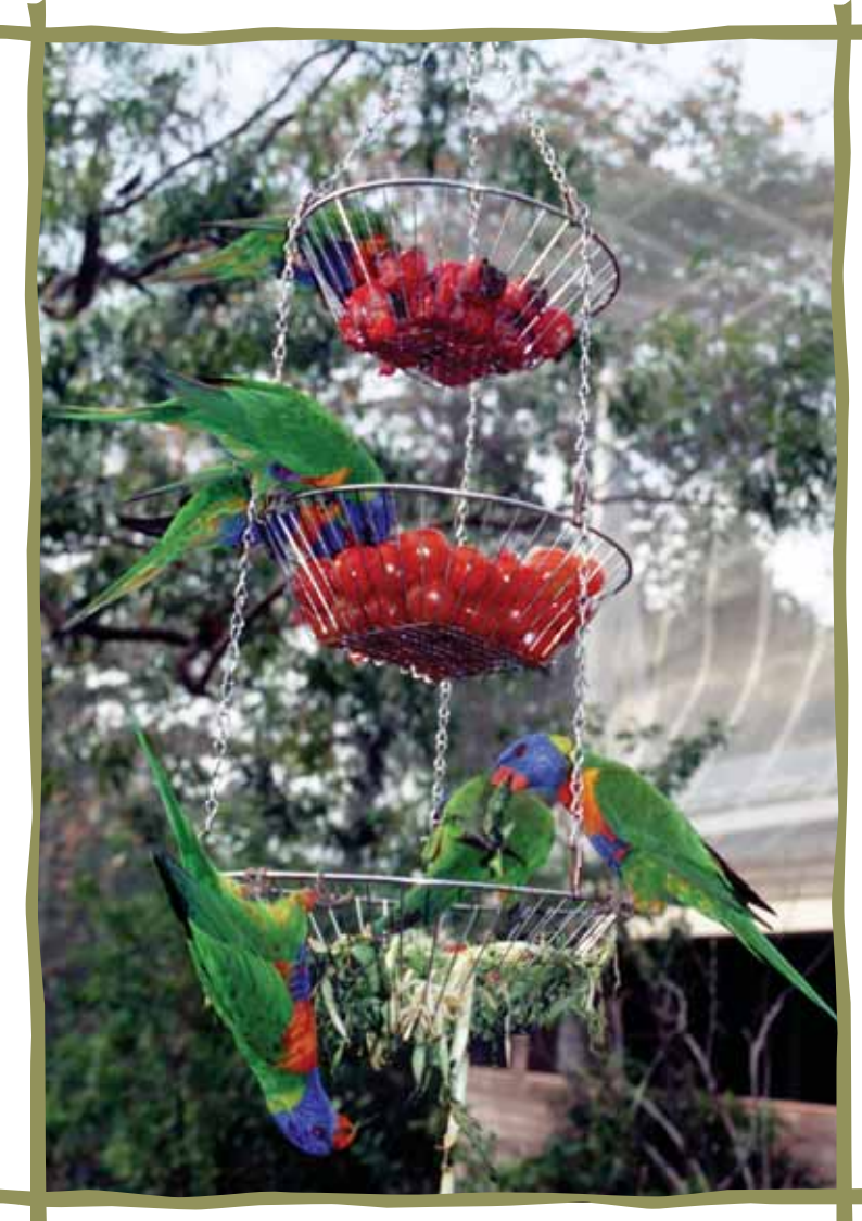
Swainson's Lorikeets enjoying a selection of fruits and tomatoes.

been my passion for more than 30 years! Their joie de vivre is infectious. They are eternally inquisitive, playful and inventive. Unfortunately, some species are not to be trusted with other parrots as they can gang up and kill them. This usually applies to the Lorius species such as the beautiful Black-capped. Here, however, the area is so vast that as long as Black-caps are greatly in the minority, peace reigns. I did notice that the Black-caps kept to themselves. This was also true of the beautiful Yellow-bibbed ( Lorius chlorocercus ) from the Solomon Islands; it has the most retiring personality of the Lorius species. One member of that genus that should never be housed with any other bird is the Yellow-backed (Chattering) because of its murderous tendencies.