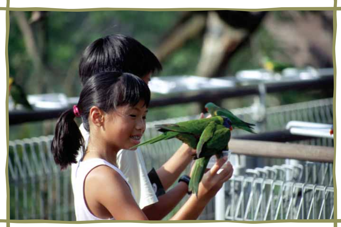
A young visitor is enchanted by the lorikeets.