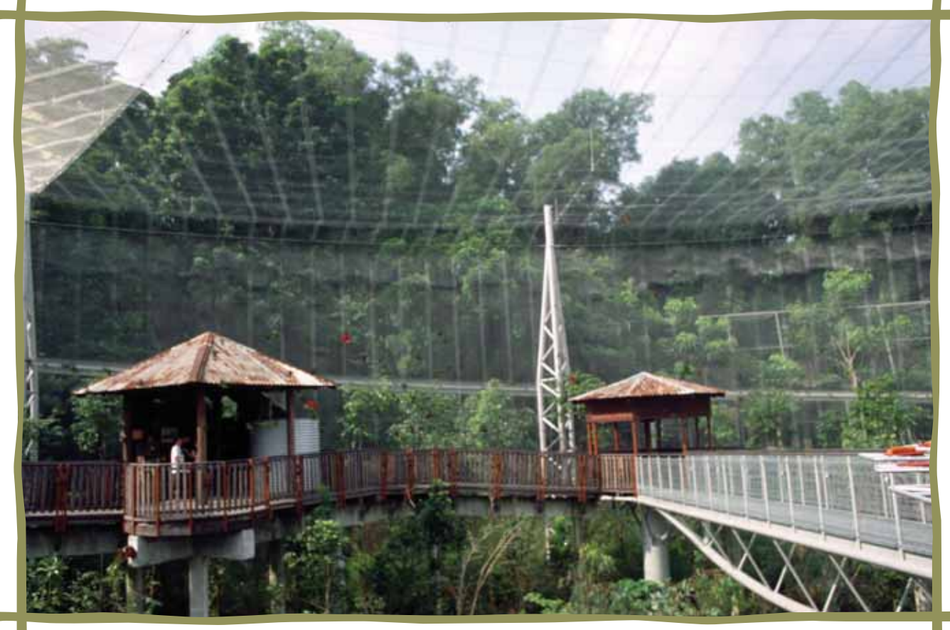
The enclosure has a light and airy ambience.