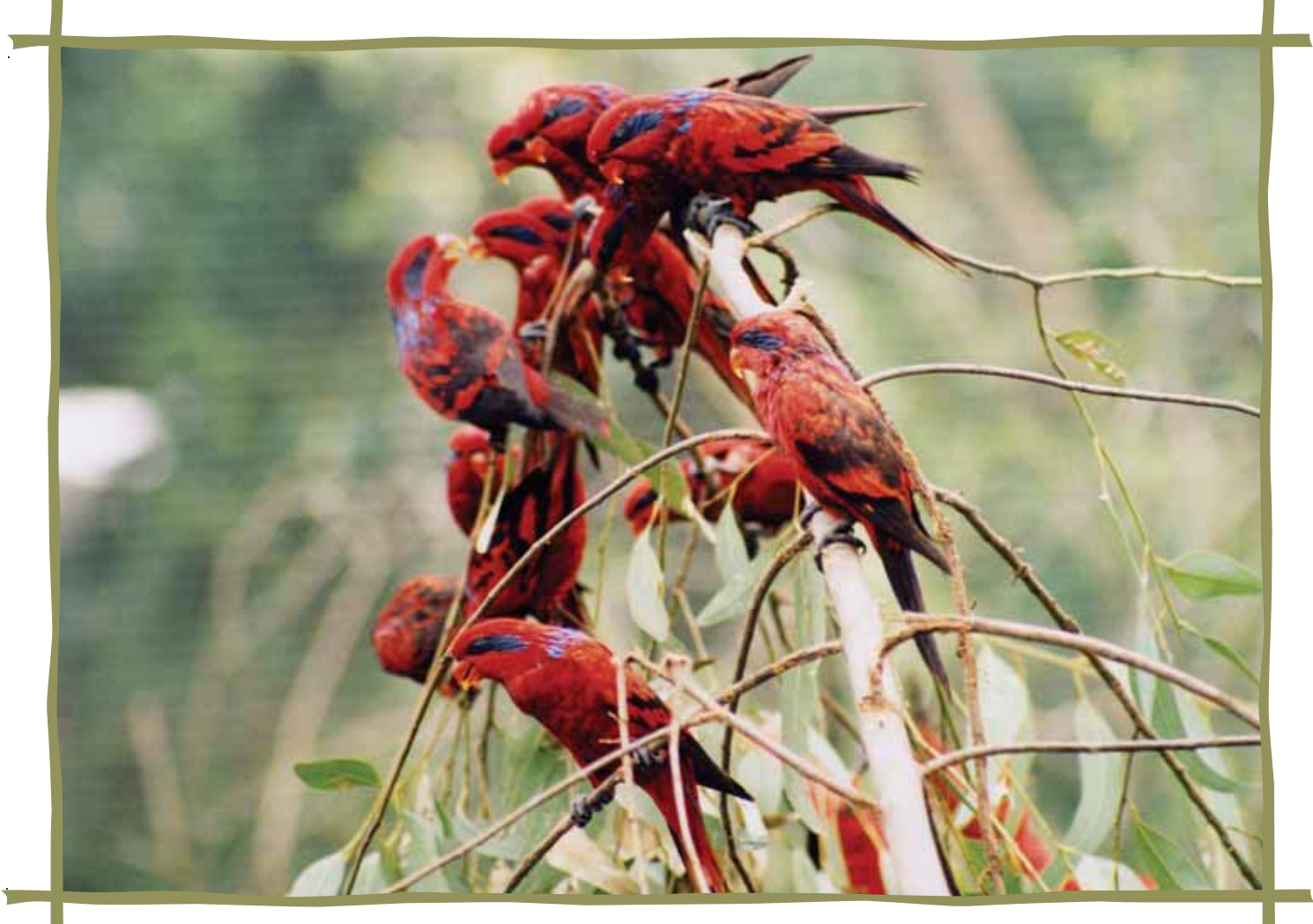
The Blue-streaked Lories prefer the company of their own species.

The air was shrill with the chattering, shrieking calls of lories, winged rainbows flashing through the trees, dangling by one foot from a branch, or swinging on a liana. This scene of colour and activity was not set deep in a rainforest but in an industrial area of Singapore. Here is located what is arguably the largest and most diverse bird park in the world, with more than 8,000 birds of 600 species. It is visited by one million people annually. Forever expanding its attractions, the most recent is Lory Loft, a lory exhibit like no other.