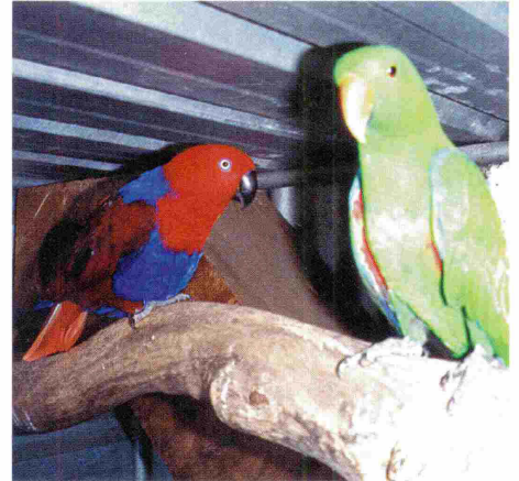
A happy pair of Eclectus polychloros Parrots in their Australian Aviary

To my knowledge, in Australian aviculture the subspecies, E. roratus , E. vosmaeri , E.