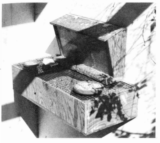
Modified feeder with 2" outer tray and a 1' x 2' x 4" catch box to collect seed hulls and droppings.

Pressurized gravity feed poultry waterer with shallow dish. To clean, place thumb over hose to hose out. Thirty five aviaries can be provided this with fresh water in less than 30 minutes.