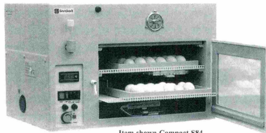
Item shown Compact S84