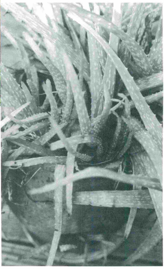
Aloe, a very valuable plant for many medicinal reasons, has taken over the strawberry pot.

ardening, in one form or another, has always been an activity that I find enjoyable. Some of my houseplants have been with me for many years. Recently I have begun incorporating vegetables into different areas of our combined yard and garden with the idea of having some fresh-grown produce and treats for my flock of parrots. They always have enjoyed the fruits of our labors, or more specifically, the fruits from our grape-fruit and orange trees. Tangerines also are a favorite. Papaya did not turn out to be an appreciated treat as I had