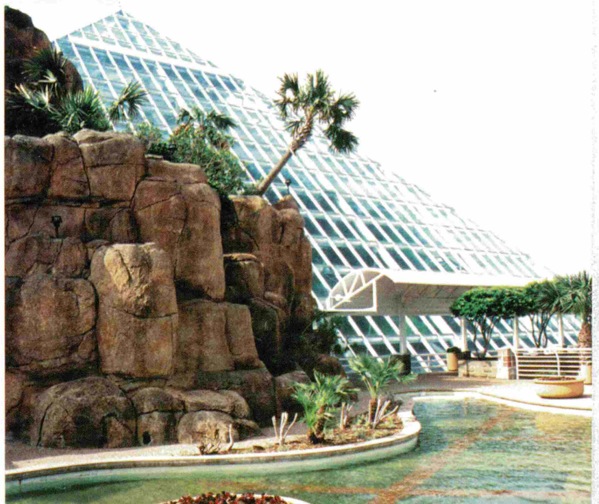
Exterior view of the Rainforest Pyramid and grounds.