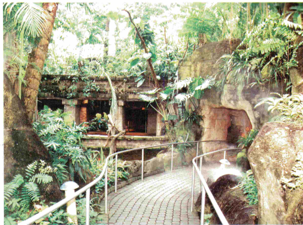
A look at some of the Mayan ruins in the Rainforest Pyramid.