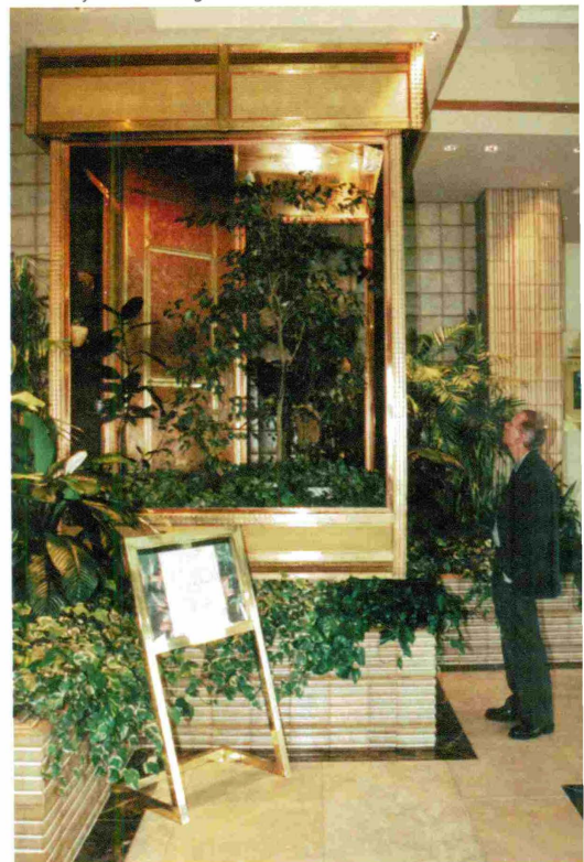
A guest in the Moody Gardens Hotel enjoying the aviary in the hotel lobby.