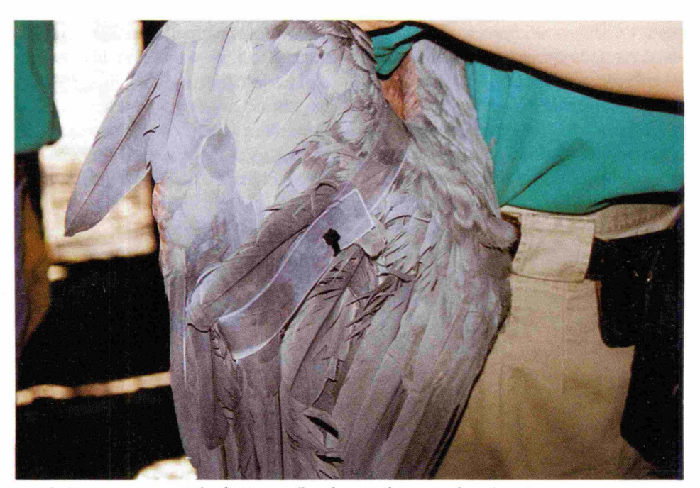
Brail placement on a Goliath Heron (brail properly secured and tied).

for the birds to have full flight abilities.