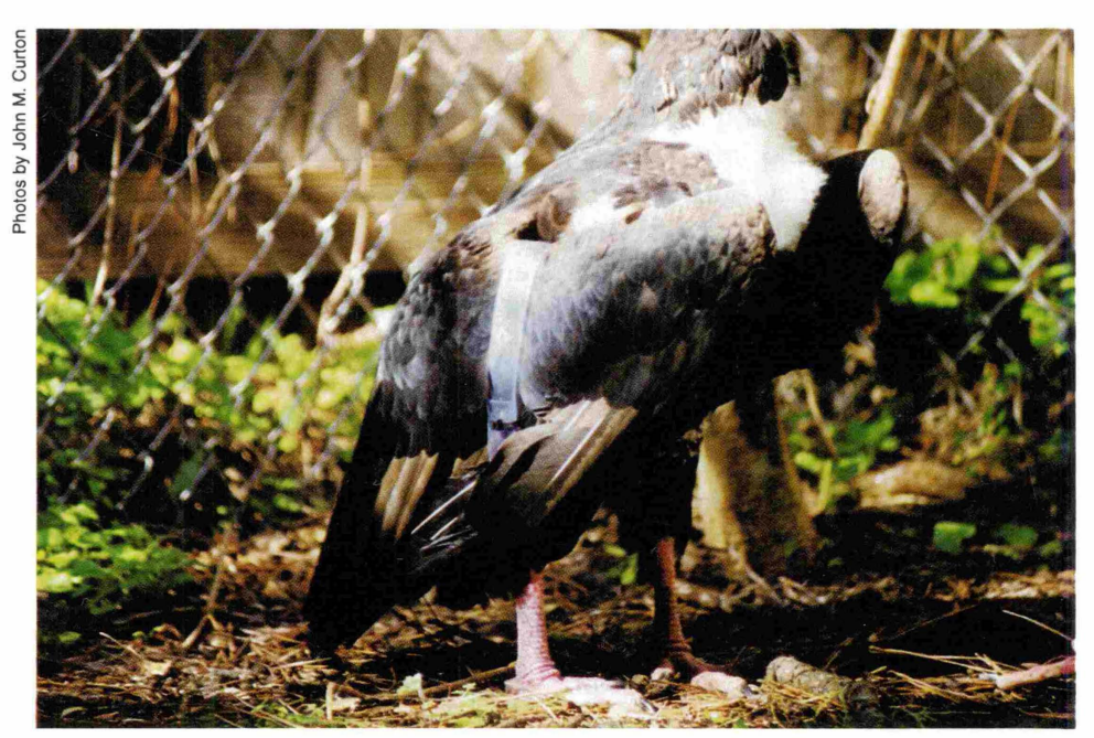
A Pondicherry Vulture with a brailed wing.