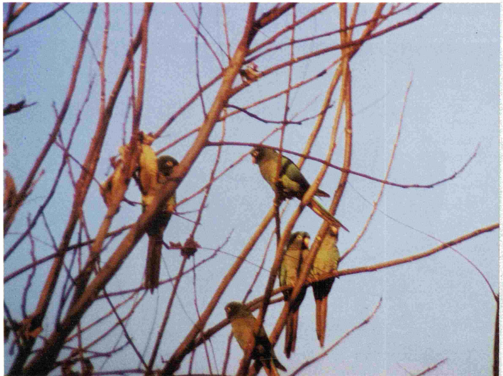
Blue-crowned Parakeets (or Conures), Aratinga acuticauda , perching in English Walnut trees in southern California.