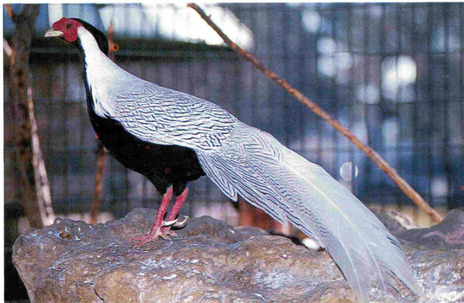
A male Silver Pheasant. Silvers are among the easiest of the ornamental pheasants to keep and breed.