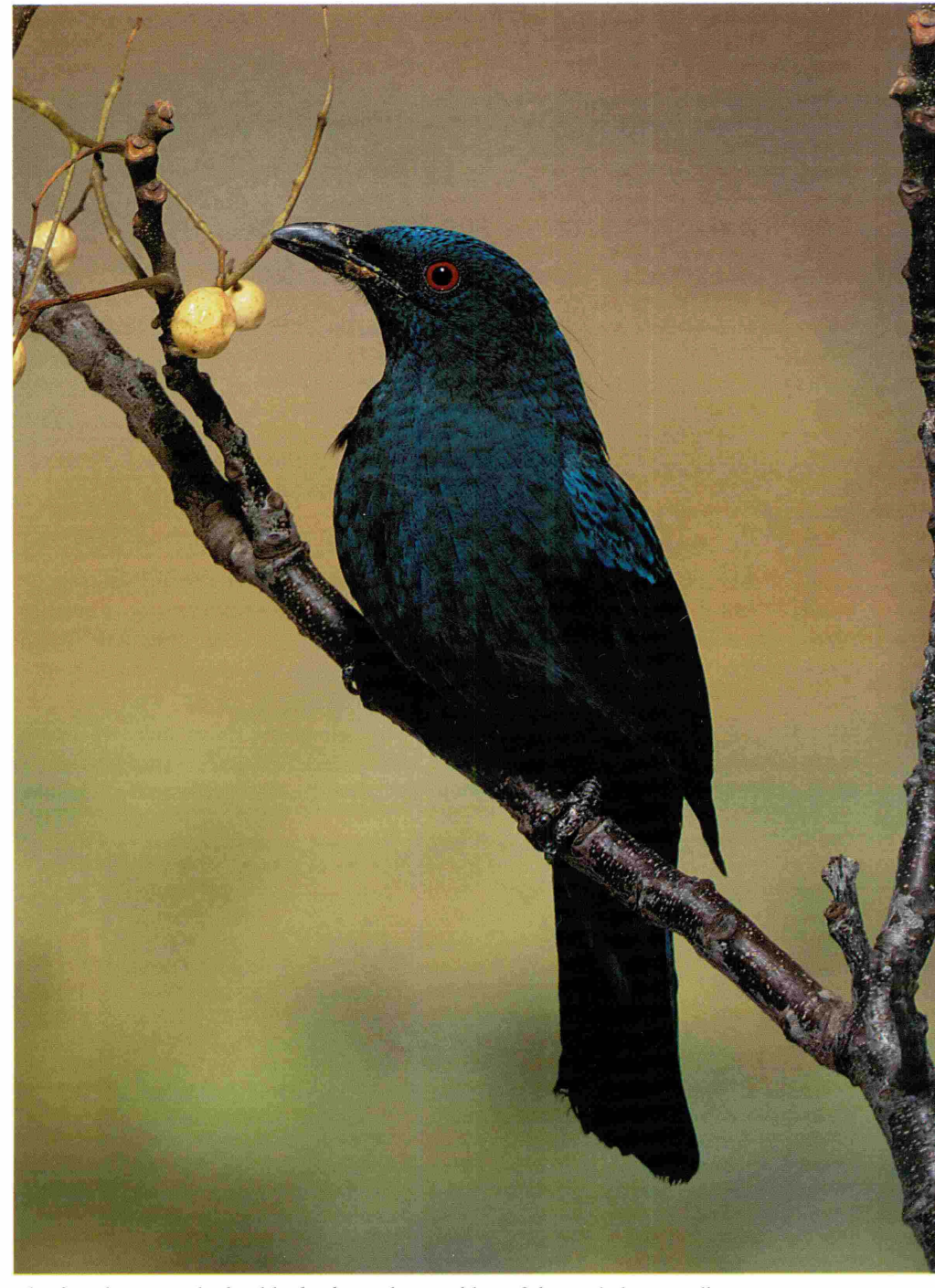
The female Fairy Bluebird lacks the iridescent blue of the male but is still attractive.

One breeder who had continued success with Fairy Bluebirds is Phil Holland from Surrey in the UK. He fixed a woven basket - similar to that used for bread - measuring about six inches across, in a bush. In June, the female would build a loosely woven cup shaped nest - similar to a blackbird or thrushes - in which two heavily marked eggs were laid. Incubation, by the female alone, lasted for 13-14 days. The young were reared mainly on small crickets - dusted with a calcium and vitamin supplement. Waxmoth larvae proved useful and small white mealworms were offered