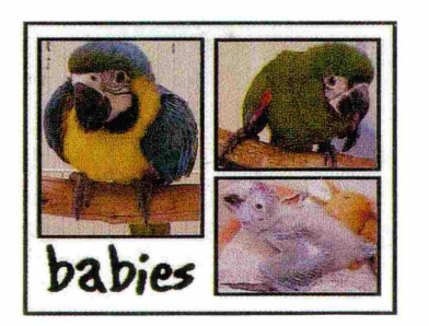
Photos of baby birds are always popular. Who can resist such adorable creatures?

A basic web page with a catchy logo and nice photograph or two of your birds can be your first step in developing a web site.