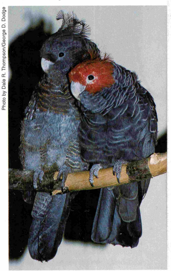
The Gang Gang Cockatoo is the smallest cockatoo found in Australia. They are sexually dimorphic with the male having the red face and crest. They are found in the mountainous forests and valleys of souhern New South Wales.

A short walk with the curator and more on my own gave me the impression of a very professionally managed bird section – lots of breeding and care for the fine details, well landscaped enclosures, compatible species, everything in pairs, even the African estrildids, for example.