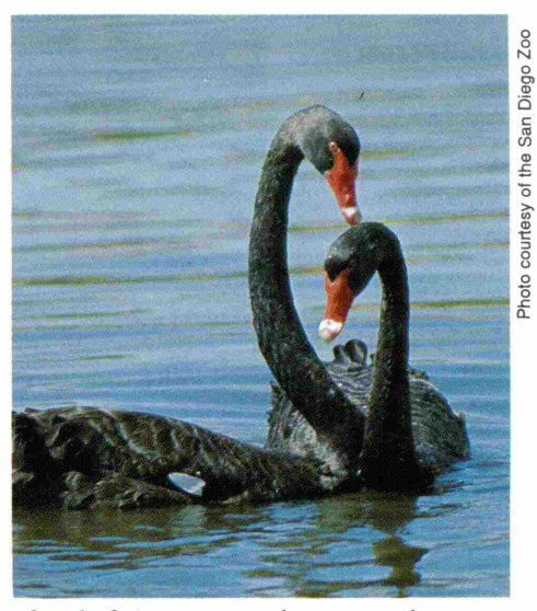
The Black Swans in southern Australia were almost too common to mention.

The Grampians is a great place to walk with a mixed bag of long, short, difficult, and easy walks. We picked a two hour walk one morning and in the bottom of a valley I heard the corkscrew-like call of a pair of Ganggang Cockatoos - the pair flew over my head and landed in a large gum tree a few meters away but pretty high. I took video of them with my heart in my throat and noticed the male disappear into a hole - sure enough it was a nest site with both birds going in and out of the hole continually until I had to leave (or get divorced!). I heard them on a number of other occasions in the range and also saw Yellowtailed Black Cockatoos flying overhead in the evenings. Other memorable birds in ranges were the beautiful Yel-