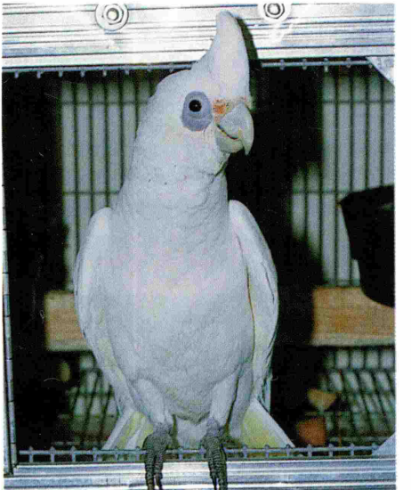
The Little Corella can be seen over a vast area of Ausrtalian mainland.

Baillon's Crake (I have chased this species around on numerous occasions in Africa) and the Australian Spotted Crake. The reedbeds produce numerous warblers and the very easily identified Golden-headed Cisticola.