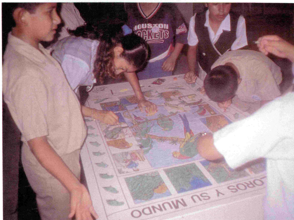
One of the 12 groups that worked to produce the best parrot poster later judged by the teachers and organizers.

poses, Mexico's parrots continue to survive. It will likely be the next generation of Mexicans that determines whether man can coexist with parrots in the wild. If the responses of those students in attendance at the first "Day of the Parrot" is any indication, then the future is looking brighter for the parrots of northeast Mexico.