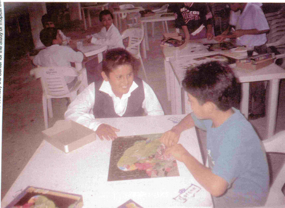
Putting together the parrot puzzles proved to be quite a challenge at the 1st annual Day of the Parrot.