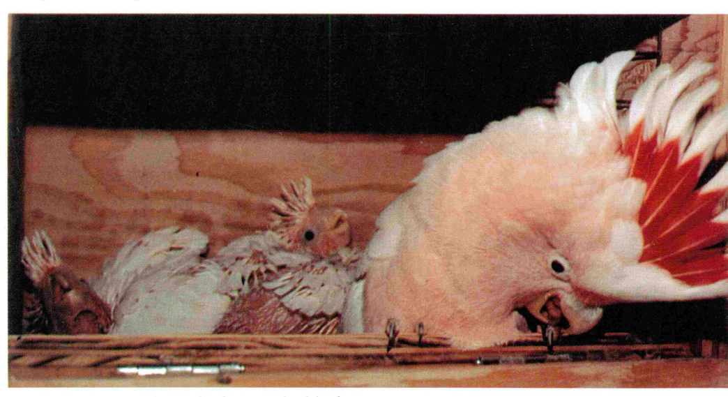
The protective male with four-week-old chicks.

Greg Bockheim has moved from the Birmingham Zoo and is now Keeper of Birds at the Disney World collection in Florida.