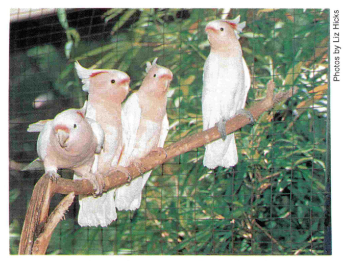
On the perch at nine-and-a-half-weeks of age. The female parent is crouched over.