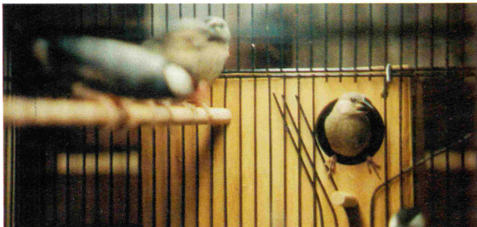
These birds were successfully bred in an 18-inch cube cage. Note the size of the wooden nest box and its placement outside the cage.

Cocks perform a mating ritual in which they incline their heads downward at a 45° angle, hop up and down on the perch, and grown towards the