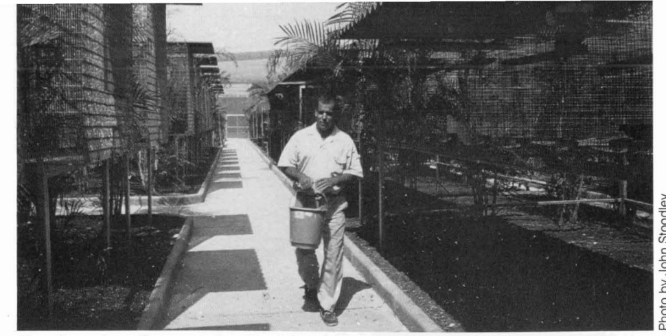
Note the wide walkways at the off-exhibit breeding center at Loro Parque.

Having visited parrot collections on several continents and having made my first visit to Loro Parque in 1984, I am in no doubt that in their pursuit of excellence, they are very successful. The beautiful climate in Tenerife must make it the envy of all bird keepers. There is sunshine most days and seldom a frost—what could be better?