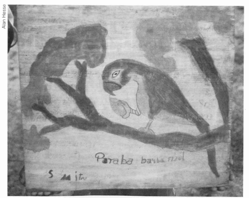
Painting of the Blue-throated Macaw by local school child in Beni, Bolivia.

Dominican Parrots: The threatened Imperial Parrot Amazona impe rialis and Red-necked Parrot A. arau siaca are principal beneficiaries of continuing LPF support for ecological studies which form the basis of a sus-