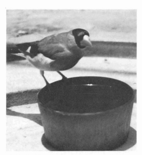
Masked Hawfinch pausing in between drinks for a picture.

The framework of the aviaries was made of galvanized pipe and overlaid with ½"x½" welded wire. All of the metal, frame and wire, was painted black for optimum unobstructed viewing and picture