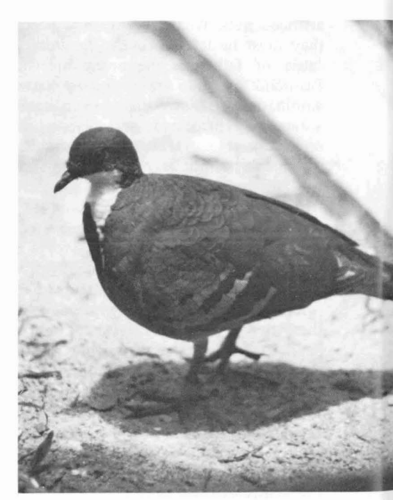
Male Bartlett's Bleeding-Heart Pigeon.

The following is my account of readily encountered introduced species and when they were introduced: