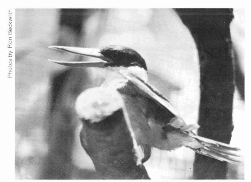
Blue-Backed Kingfisher trying to keep cool by stretching its wings and tail feathers while panting rapidly.

There are many other introduced species to the Hawaiian islands, however, they don't frequent heavily human populated areas. Unfortunately, my time was very limited, so I didn't get to explore the island of Oahu thoroughly for some of the native birds. I was hoping to get pictures of the unique Hawaiian Honeycreepers at the Honolulu Zoo, but there were none to be seen. I'll go back to Hawaii in the future to pursue my bird watching and photography when I'm no longer limited to a short visit.