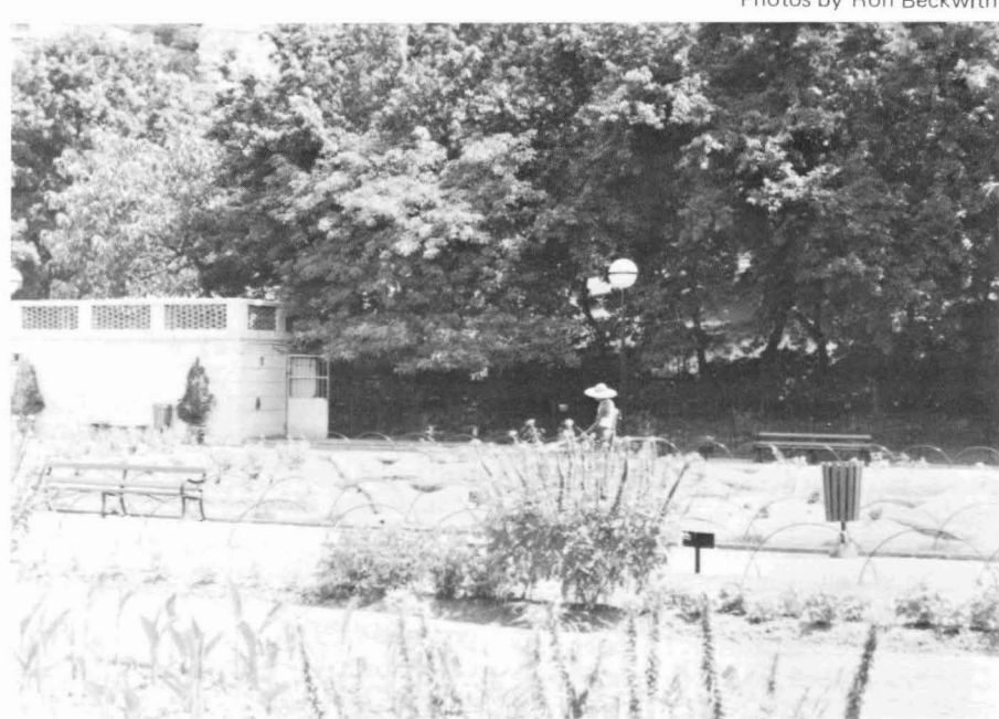
Entrance of the Hong Kong Botanic and Zoological Gardens. The aviaries are slightly up hill and behind the trees.