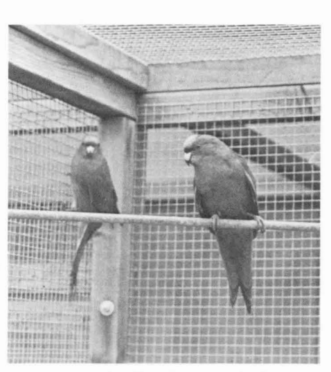
Breeding pair of Yellow-fronted Kakariki.