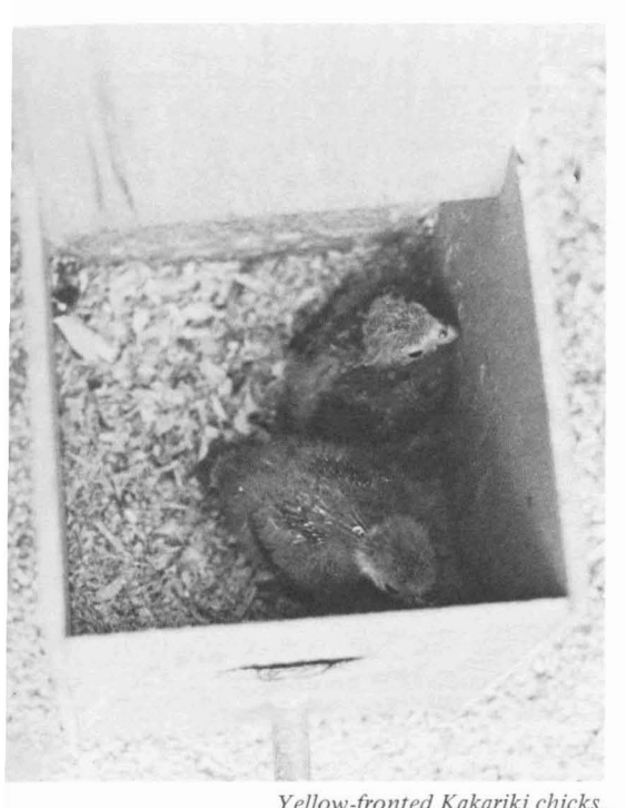
Yellow-fronted Kakariki chicks.

in captivity. They are extremely hardy birds in the wild, having adapted to a wide range of habitats from mountain forests to lowland scrub and grasslands. In captivity they are hardy, as well. They should be kept in a dry environment, however, as they spend considerable time on the ground.