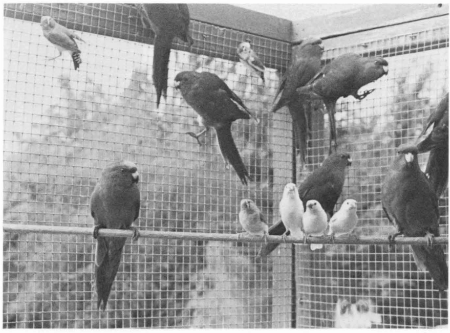
An 'informal' group of Zebra Finch and Kakariki. Yellow-fronted Kakariki – left. Red-fronted on right.

Kakarikis are gregarious birds in the wild and get along well together in groups