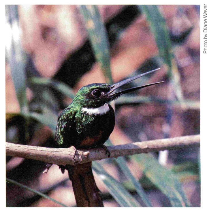
Like giant hummingbirds, the male jacamar has a white throat patch while the female has a tawny one.

length although the front appeared to have been disturbed and the burrow might have been a bit longer originally.