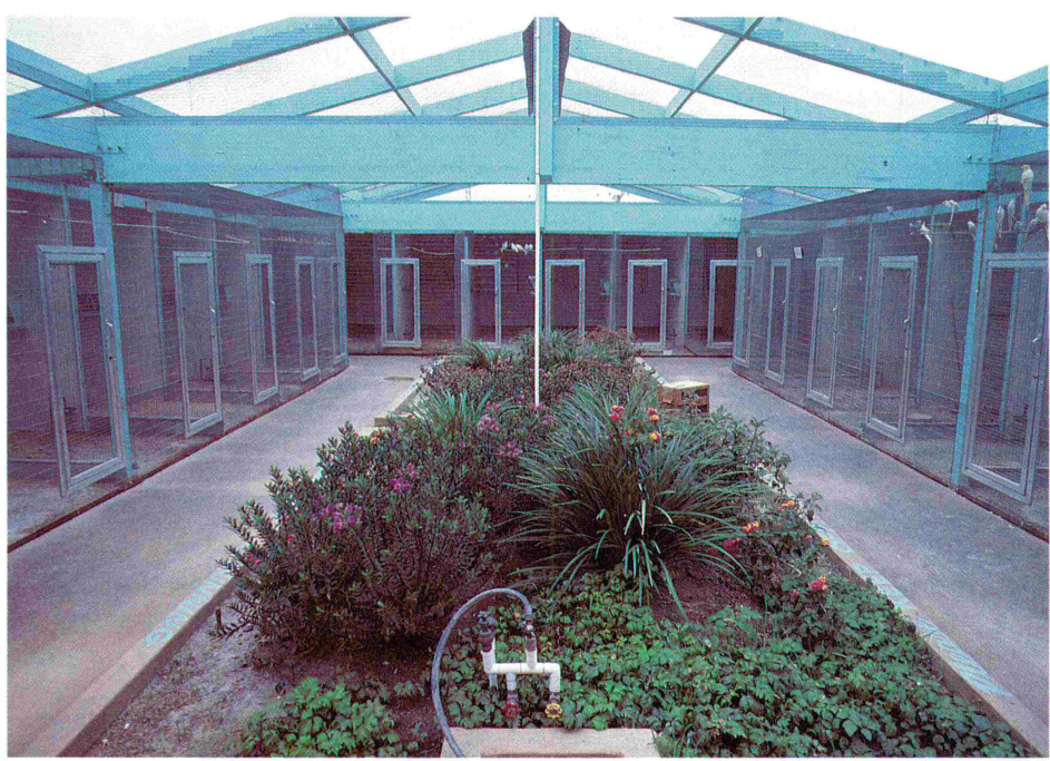
The new outdoor aviaries on the second floor of the new store.