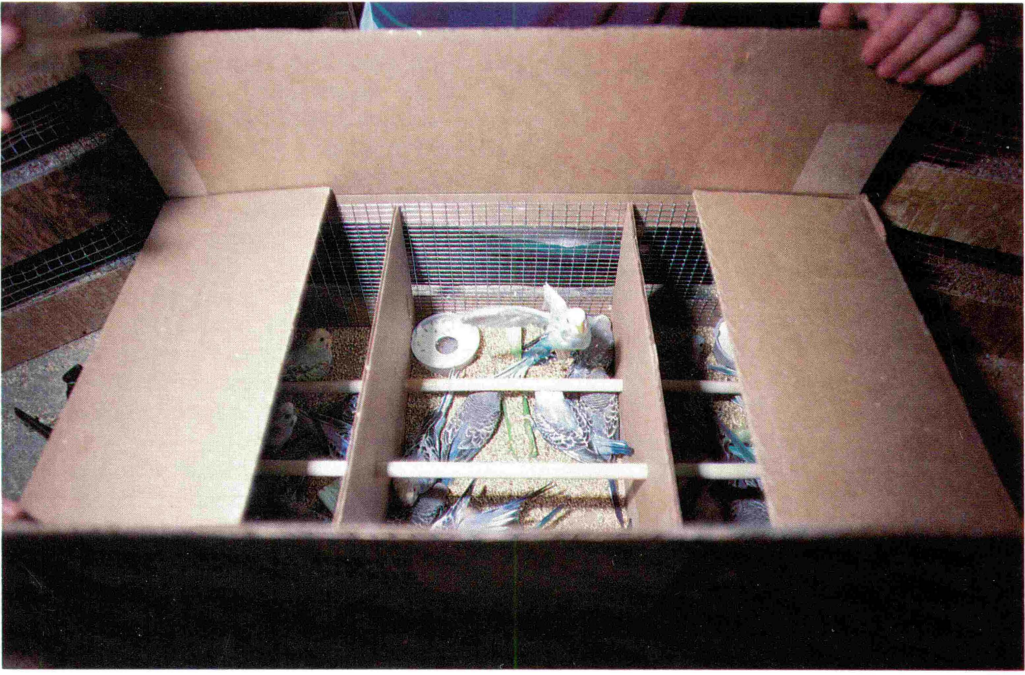
Birds in shipping boxes with plenty of seed, etc.