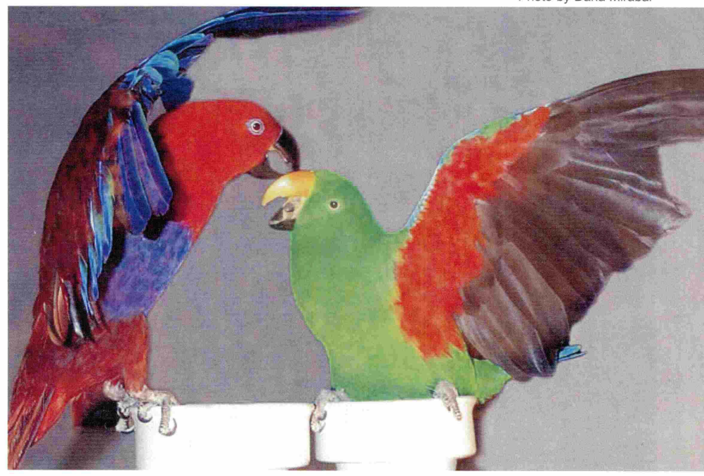
A little fencing sometimes indicates a pair is forming and working out the details. After these little jousts the pairs often settle down one notch closer to bonding.

Reputable Eclectus breeders occasionally go out of business and their problem-free breeding pairs become available, but these pairs most often go to friends or fellow breeders who know the birds' history. Proven breeding pairs without problems are not often advertised to the public and the opportunity to buy such a pair is rare. Proven pairs that are advertised for sale frequently have problems, such as one or both birds destroying their eggs and babies. Reputable breeders reveal such problems to the potential buyer but unfortunately, there are sellers who choose not to disclose this information, leaving the buyers to learn for themselves "how they got so lucky" to find a proven breeding pair for sale. It can be treacherous for a new breeder who is attempting to acquire good Eclectus pairs for breeding, but there is a good alternative and that is