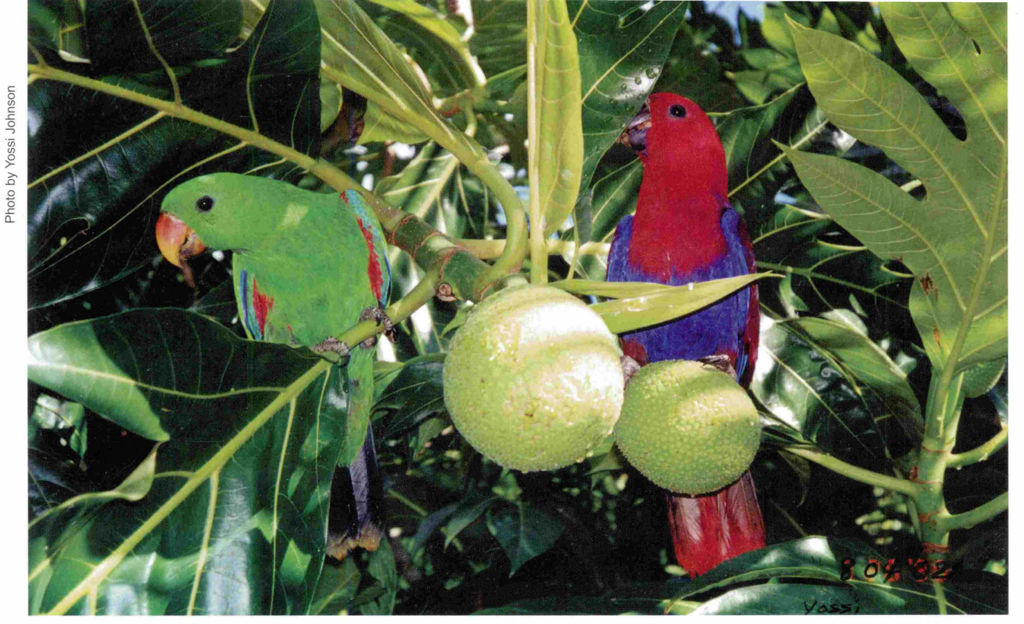
This Red-sided Eclectus pair is blessed with a huge play pen in which they have all the luxuries nature can provide. They are able to fly, perch, look for something to eat, and do almost everything their wild cousins can do. They love their breadfruit tree seen here.

Another advantage is that younger Eclectus are more curious about other birds and therefore are more accepting of the companionship of a mate.