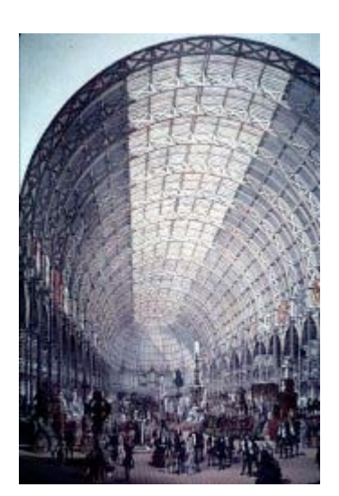
Figure 1: An image from the 1853 Dublin World's Fair and its binary equivalent.

orchestra performs a score. He calls this a distinction between code and surface: '[t]he source code represents a kind of notation or musical score that is interpreted by the computer when a page is called up by a specific browser'. Each time a page is invoked the browser performs the code and displays it on the surface of the monitor. For Richard Powers, binary code represents a true transformable panglossary, where every impulse is conveyed as strings of binary digits. These binary digits are not interpretable by humans: we cannot look at a disk array and know whether we are looking at email, a digital image of the Statue of Liberty, or an Excel spreadsheet.