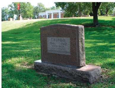
Fig. 3: Tripod’s grave on the north lawn.