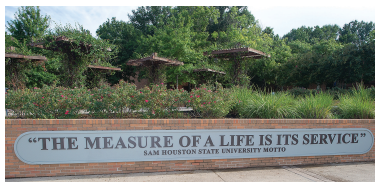
Fig. 1: SHSU Mall Area

Texans may be more familiar with Texas A&M's Aggie Code of Honor or the University of Texas' Latin motto, Disciplina praesidium civitatis , but fewer Texans know the words that have guided the students of Sam Houston State University (SHSU), an institution whose roots are thirty years older than either of the larger universities.