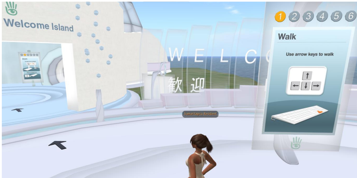
Figure 2: Welcome Island