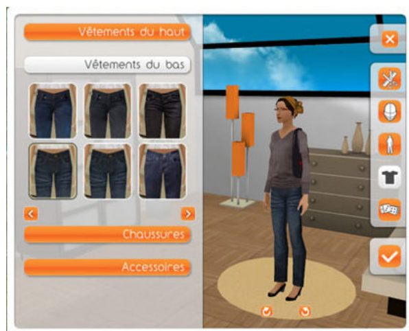
Avatar personalization tool