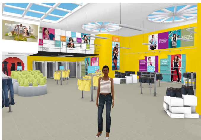
Avatar in a 3D shop