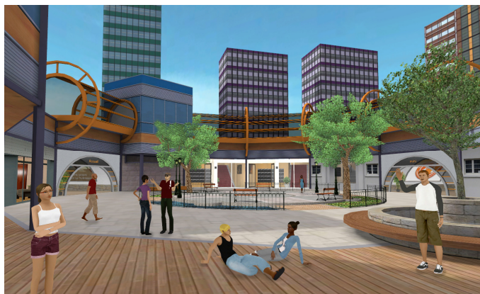
Avatars in outdoor spaces