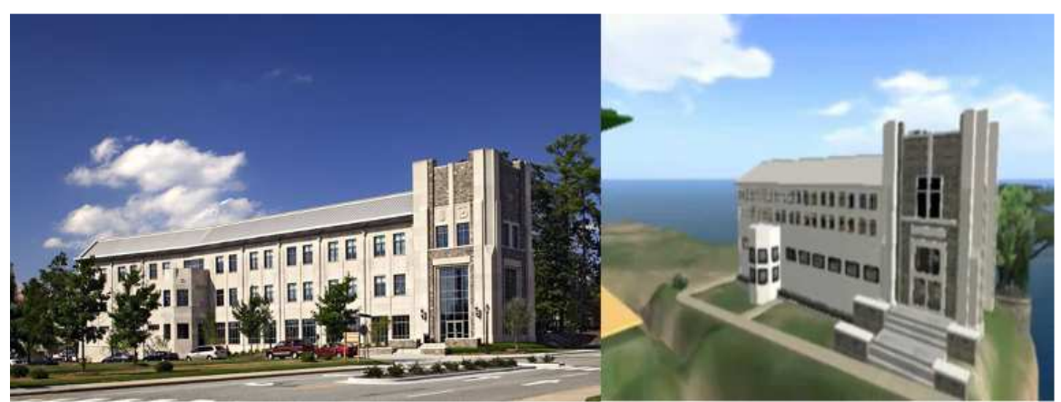
Figure 1. Real world DUSON and Second Life® DUSON

Presence is a cornerstone of success in distance based higher education health care for students. At the Duke University School of Nursing (DUSON), students are immersed in the Second Life® virtual world by attending lectures in a building similar in appearance to the real world counterpart found on the Duke University campus in Durham, NC. The building has a classroom for lectures and an atrium where students can socialize and access to resources for landmarks, tutorials, and avatar clothes, skins. and shapes (http://nursing.duke.edu/modules/son about/index.php?id=90). The classroom consists of chairs for students to sit in, a podium for the instructor to lecture, a computer to manage PowerPoint slides, a whiteboard for PowerPoint presentations, and a blackboard. The blackboard serves two purposes. First, it allows students to text questions to the professor which appear on the blackboard, thus the professor can incorporate the answers directly into the lecture without stopping the lecture. Second, it stops the students from texting each other in class using local chat, since all text appears on the Blackboard.