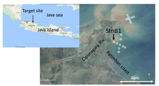
Figure 1 - Location of target site and monitoring points

In order to elucidate fine sediment transport process and resulting bathymetry evolutions, field surveys were carried out with monitoring of spatial distribution of suspended sediment and fluid mud in the estuarine system under a tropical climate environment with a wet and dry season. We successfully captured the difference between the wet and dry season in vertical structure of bulk density through the water column from the sea surface through consolidated mud bed. Observed data including the seasonal variation of fluid mud thickness can be applied for the modeling works of the fine sediment transport process in the target site, which is our future work.