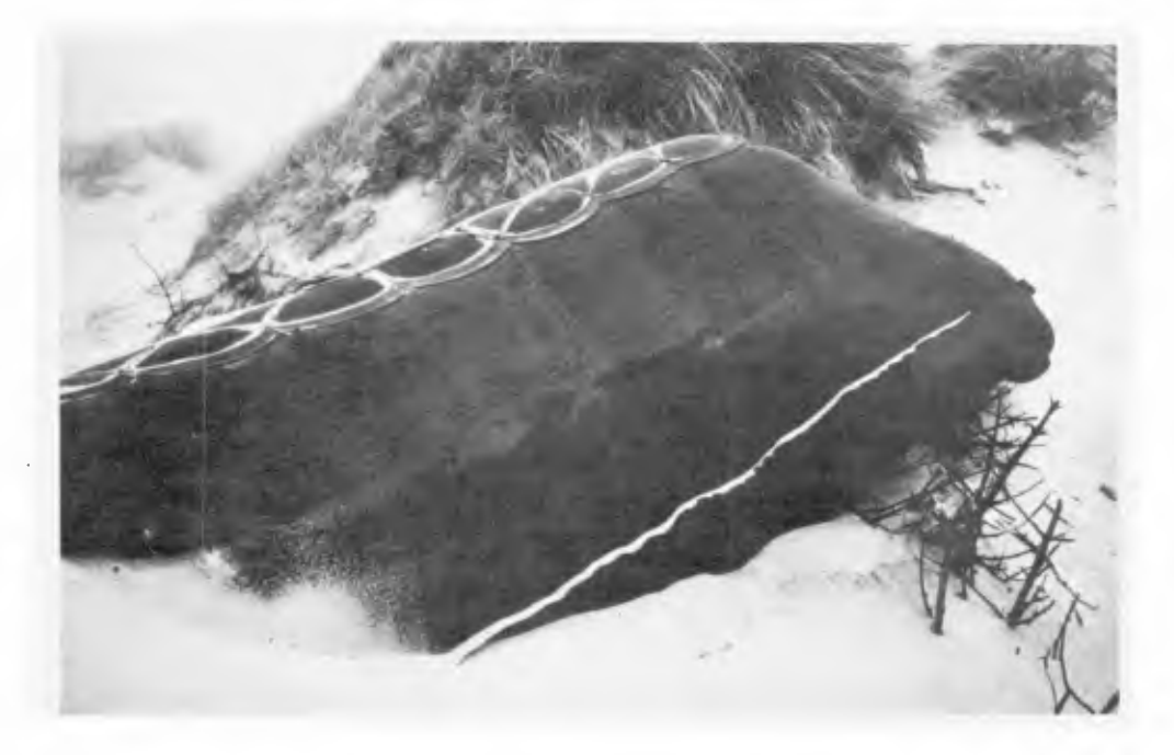
Fig. 3. Tubes wrapped into a filter sheet.

thus protected against sunlight, is still intact, covered with barnacles, cockles and other sea-life.