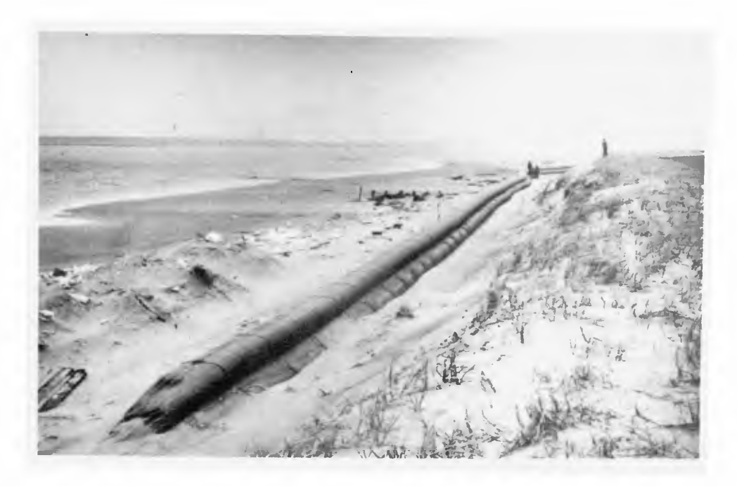
Fig. 7. Sydhalen (Thyborøn).

The tubes were laid out on the west beach of the spit and thus face the east part of the southern Thyborøn barrier; the construction is not therefore in a very exposed position. (Fig. 7).