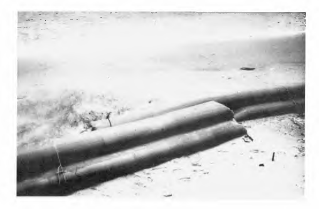
Fig. 2. Structures composed of sand tubes with diameter 0.7 m (1 tube on top of 2)

Various methods have been tried to make the rubes in the structures behave as units. In some cases tubes have been lashed together by plastic ropes, in other cases tubes have been wrapped in filter sheets. Later experiments have involved weaving together the lower tubes in prism structures.