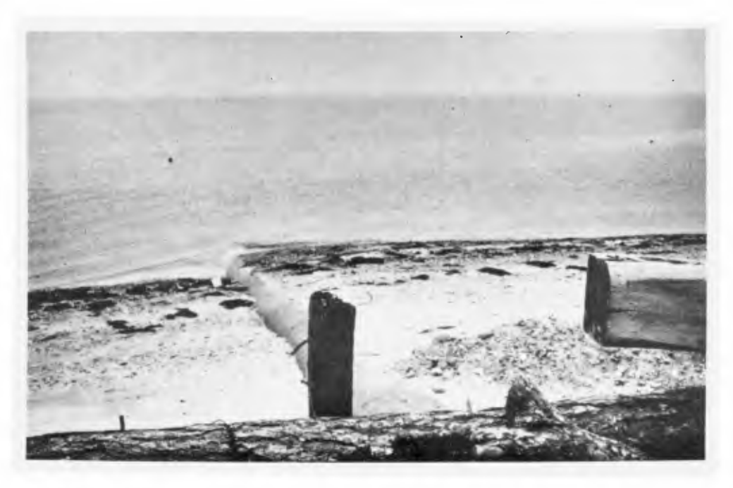
Fig. 6. Enebærodde (Funen).

A extensive measurement program following the experiments will be finished and finally evaluated in the summer of 1971 so far it can be stated that in the period summer 1969 to spring 1970 stabilisation of the beach has been noted.