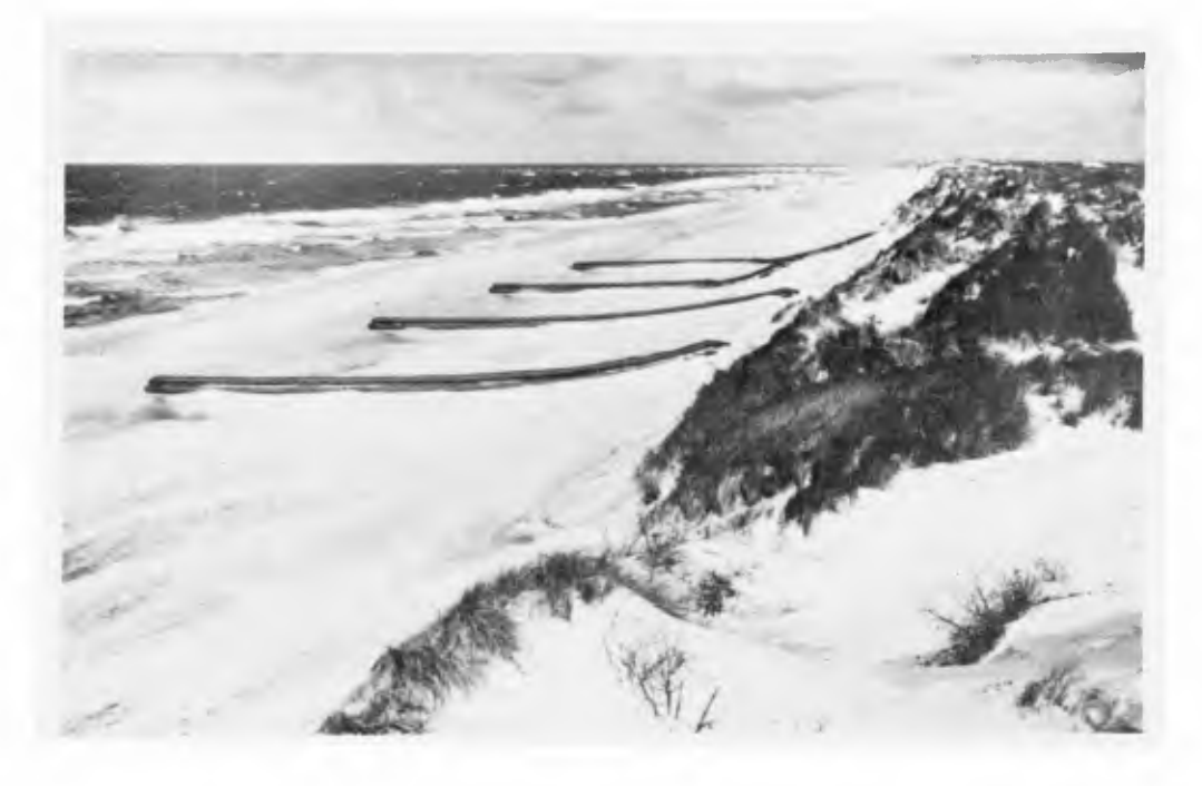
Fig. 5. Beach groins (Hvide Sande. The danish North Sea Coast).

The other ridge boomerang shaped. Total length 70 m. Laid out on the beach at level + 1 m. After a short while the structure sank and is now buried in the sand.