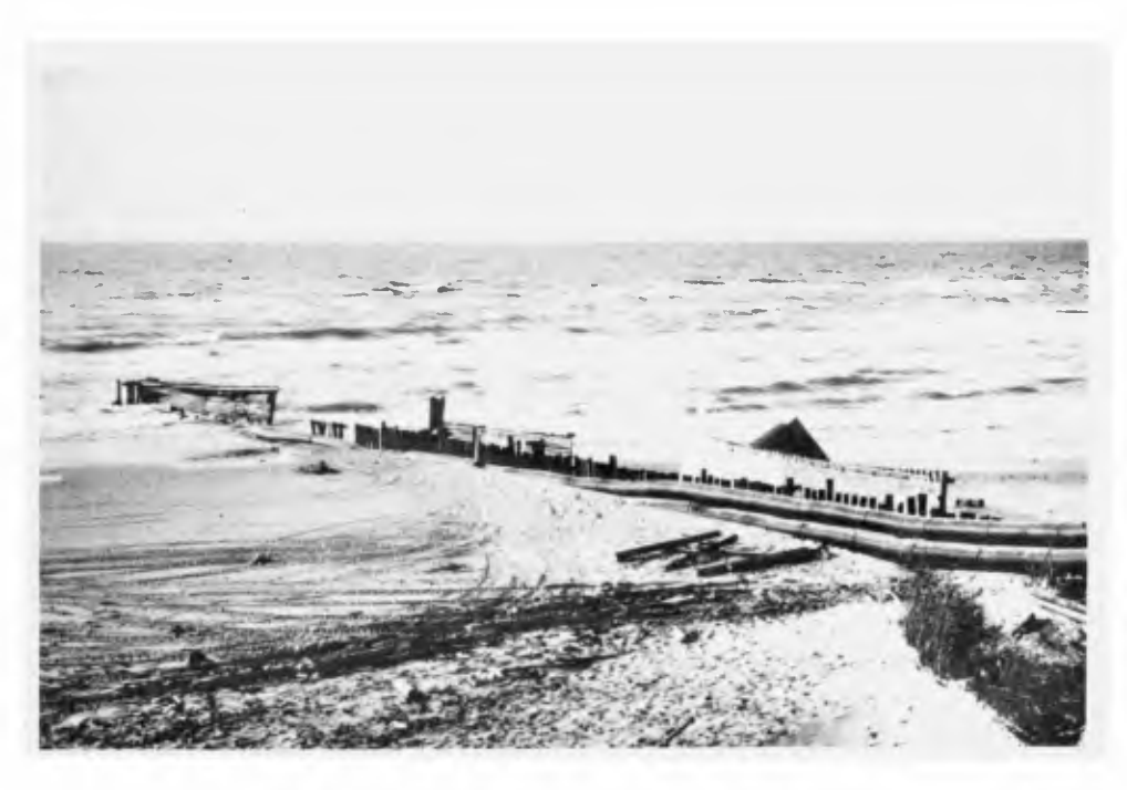
Fig. 4. Sand tube groin (Lønstrup at the Danish North Sea Coast).