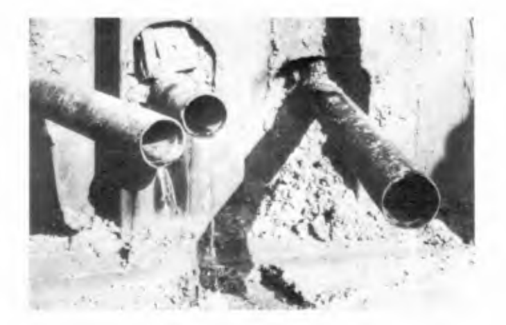
Fig.2: Auger-bored inclined drains lined with pitch fibre pipes ready for connection to the collecting toe drain.

When the auger entered the gravel strata usually a flush of water came down the augered hole bringing with it some of the material, which gave a good indication of whether the vertical drain had been met, although this is not essential since the gravel on top of the clay is quite permeable being much coarser than that higher up.