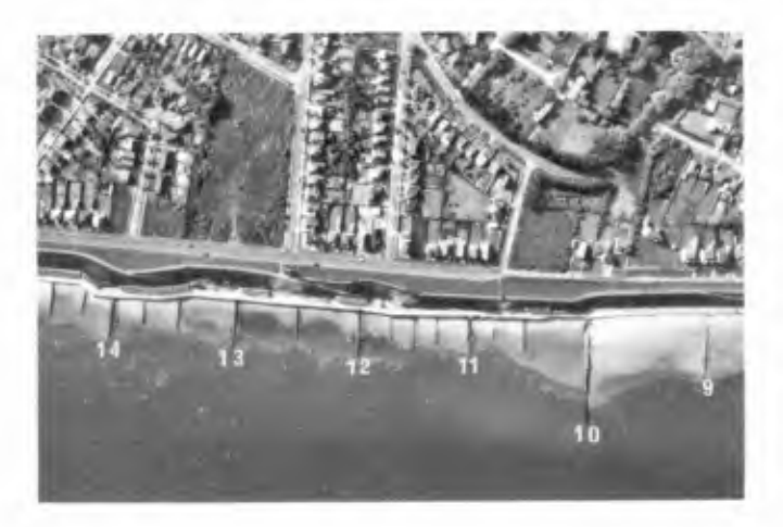
Fig. 4: Part of the frontage with large groyne No. 10 (Distance between numbered groynes 100 m.)