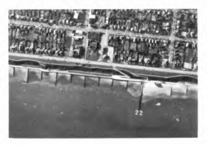
Fig. 5: Part of the frontage with groyne No. 22

The improvement in the beach after the completion of the Emergency Works could be seen far beyond the area of tipping and was better than had been anticipated.