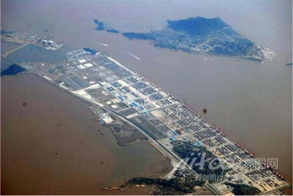
The Yangshan Port in Shanghai