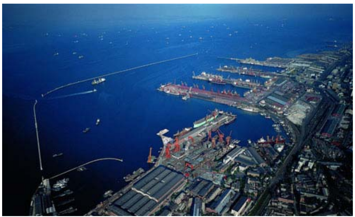
The Dalian Port in Northeast China