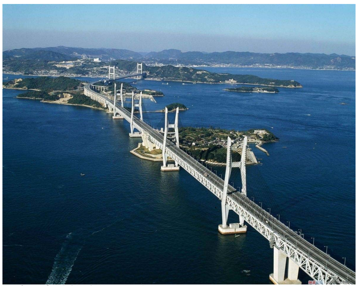
The Cross-Sea Bridge in Hangzhou Bay