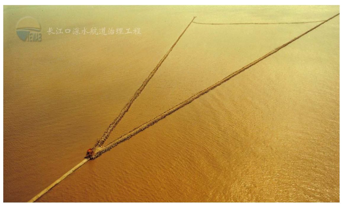
The Flow Splitting Project of the Yangtze River Estuary Deep-Water Channel Training Project

Cover Photo: The Waigaoqiao Port in Shanghai